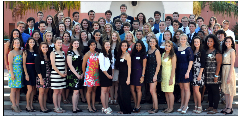
Dollars for Scholars Class of 2013 gathers at Sebastian River High School before the 48th Annual Awards Ceremony

DOLLARS FOR SCHOLARS awarded 96 college scholarships to 66 local students at its 48<sup>th</sup> Annual Awards Ceremony, held at Sebastian River High School's Performing Arts Center on May 23, 2013. This year's recipients will receive $504,000 in need-based financial aid to attend 28 colleges and universities in 9 states and the District of Columbia.