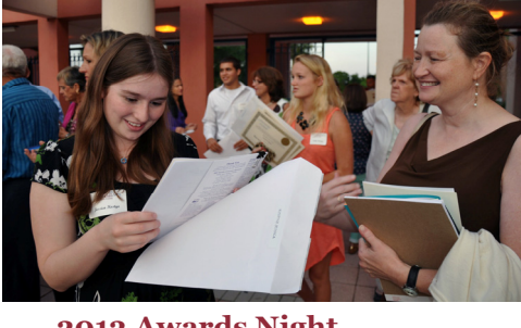
2013 Awards Night Recipients, parents, sponsors, and friends celebrate after the ceremony

"I love to see the smiles of the recipients and their parents as they open their award envelopes. Knowing that I can help these kids get a college degree and reduce the financial stress on their families is why I love supporting Dollars for Scholars."